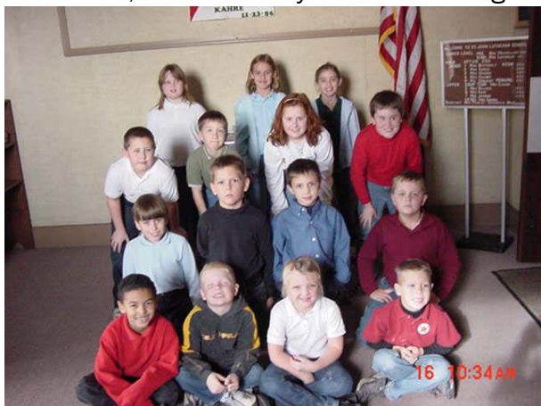
October and November Students of the Week